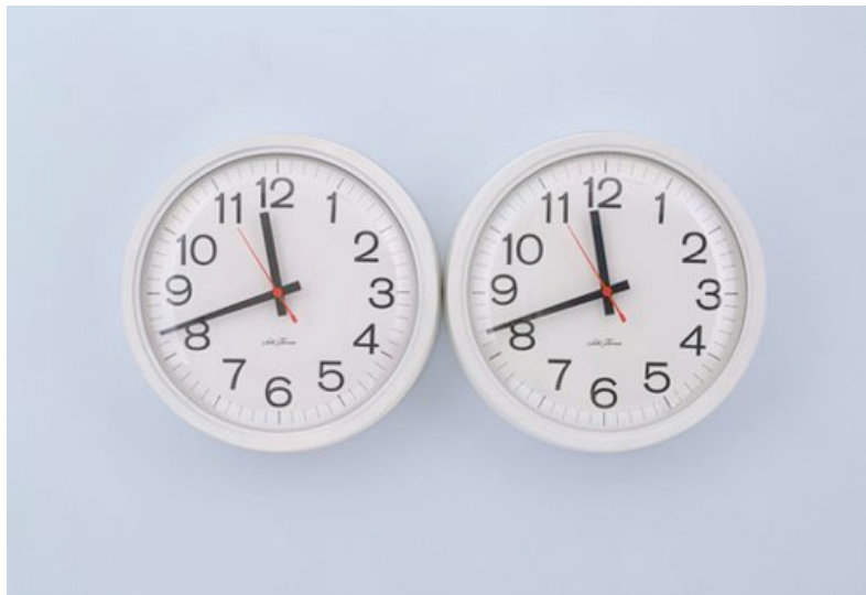
Felix Gonzalez-Torres, Untitled (Perfect Lovers), 1991, Clocks, paint on wall, Overall 14 x 28 x 2 3/4 inches. © 2008 The Felix Gonzalez-Torres Foundation, Courtesy Andrea Rosen Gallery, New York. Image via: MoMA